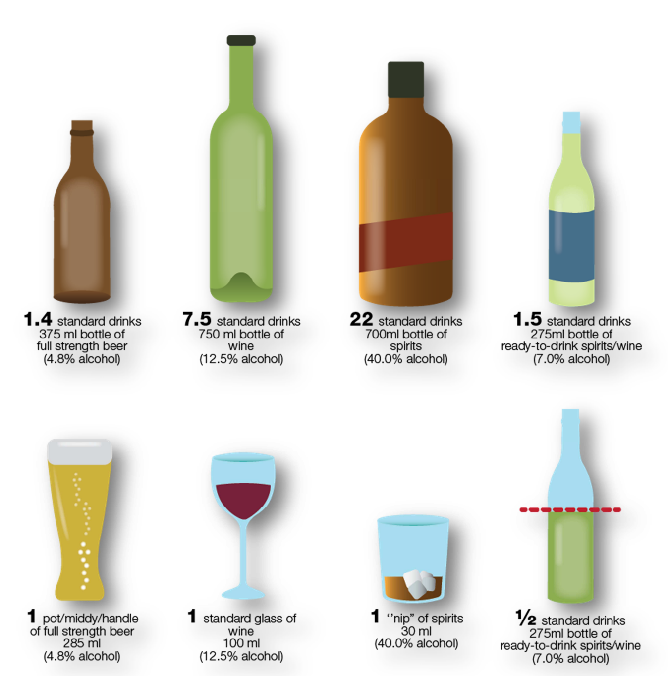
Figure 2: Measure your standard drinks. (Australian Drug Foundation, 2018).