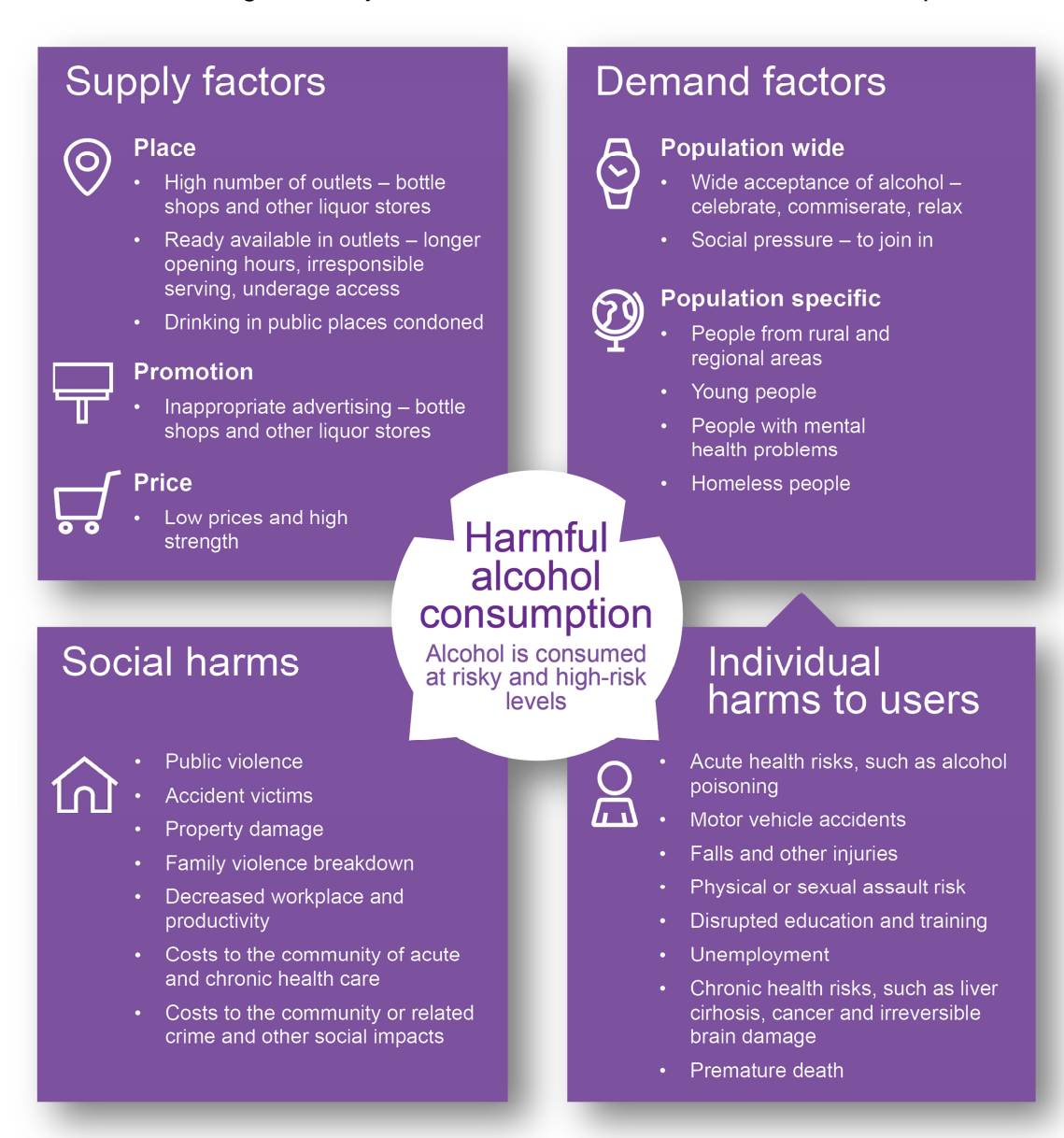
Figure 1: Major contributors to harm from alcohol consumption (Dibley G, 2007).

In addition, the publication Pathway to reducing harm from alcohol consumption: A guide for local government (South Metropolitan Population Heath Unit, 2014) supports local government to manage the major contributors to harm from alcohol consumption.