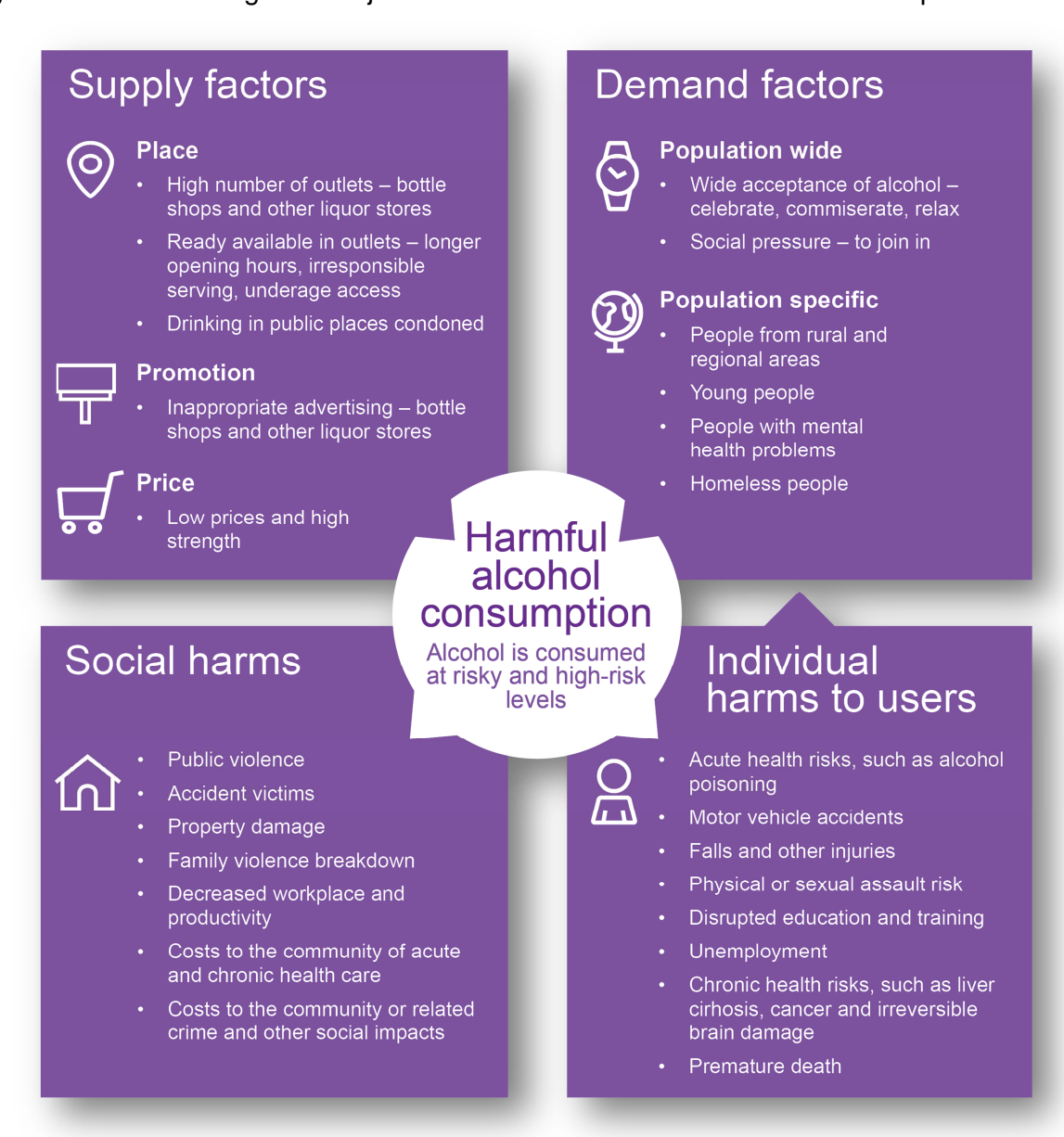
Figure 1: Major contributors to harm from alcohol consumption (Dibley G, 2007).

In addition, the publication Pathway to reducing harm from alcohol consumption: A guide for local government (South Metropolitan Population Heath Unit, 2014) supports local government to manage the major contributors to harm from alcohol consumption.